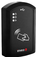
RFID USB Desk desk RFID reader