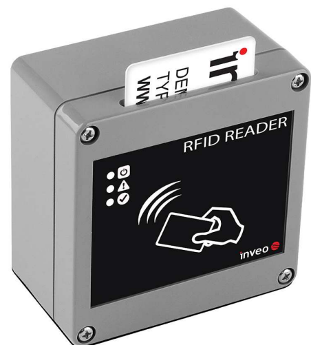
RFID IND-LED Slot housing option with card slot