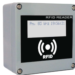
RFID IND-LCD industrial RFID reader